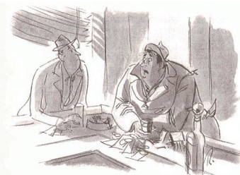
"When I think of all the wasted time and money! Fifty cents a month for no-dues-or-fees, bus fares to meetings, and four-fifty for the Big Book, which I didn't even read!"

An excerpt from "A Rabbit Walks into a Bar: Best Jokes & Cartoons from AA Grapevine"